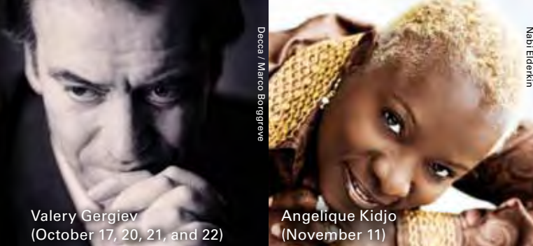
Valery Gergiev (October 17, 20, 21, and 22)