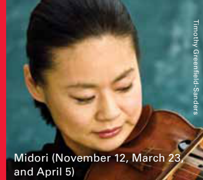
Midori (November 12, March 23, and April 5)

Visit carnegiehall.org/groups for the complete season.